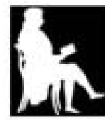
St John's Press