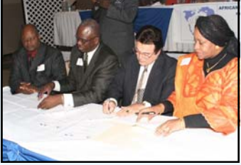
Signing Ceremony between Chairman & Founders of ABR & MBRT

On November 8, 2008, MBRT signed a strategic partnership with the African Business Roundtable - USA to promote international business opportunities and establish trade links between Africa and the United States as well as support each organization's mission of job creation, business development and economic growth for African, African American CEOs, and minority businesses. The partnership will raise awareness of contract opportunities between the U.S. and the African continent. We will work with government agencies to help them meet mandated U.S. minority business set aside contracting requirements. This will enhance cultural exchange and economic growth through international trade.